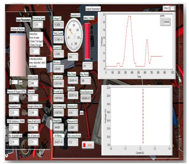
Fig.1. LabVIEW program result at STP

a LabVIEW program result in comparison to that is